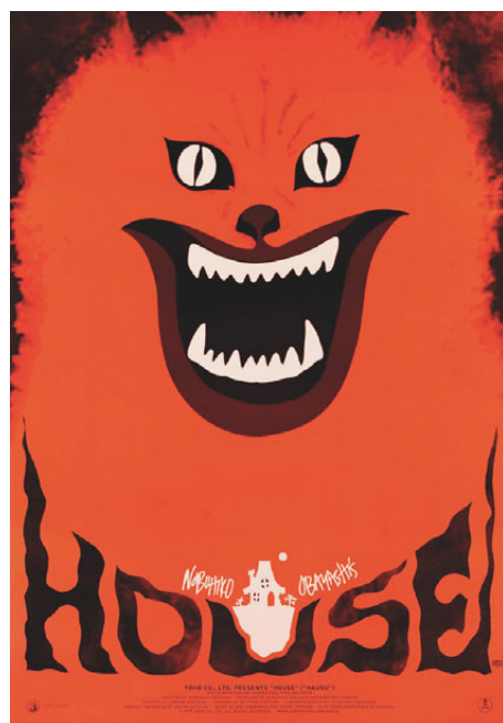
Ōbayashi Nobuhiko's House (1977)