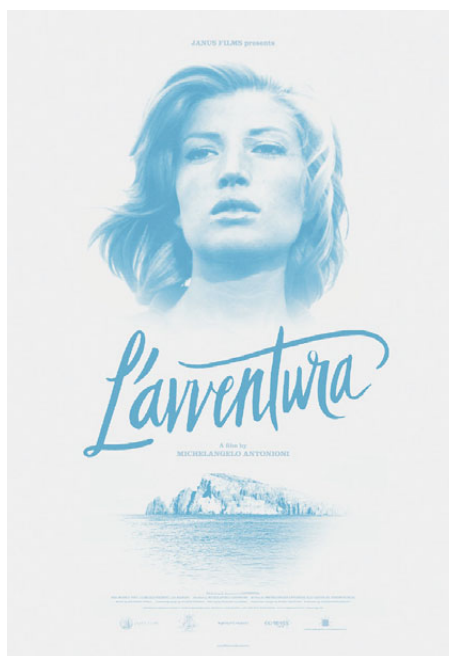
Michelangelo Antonioni's L'avventura (1960)